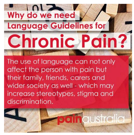
Painaustralia Social Media Tile