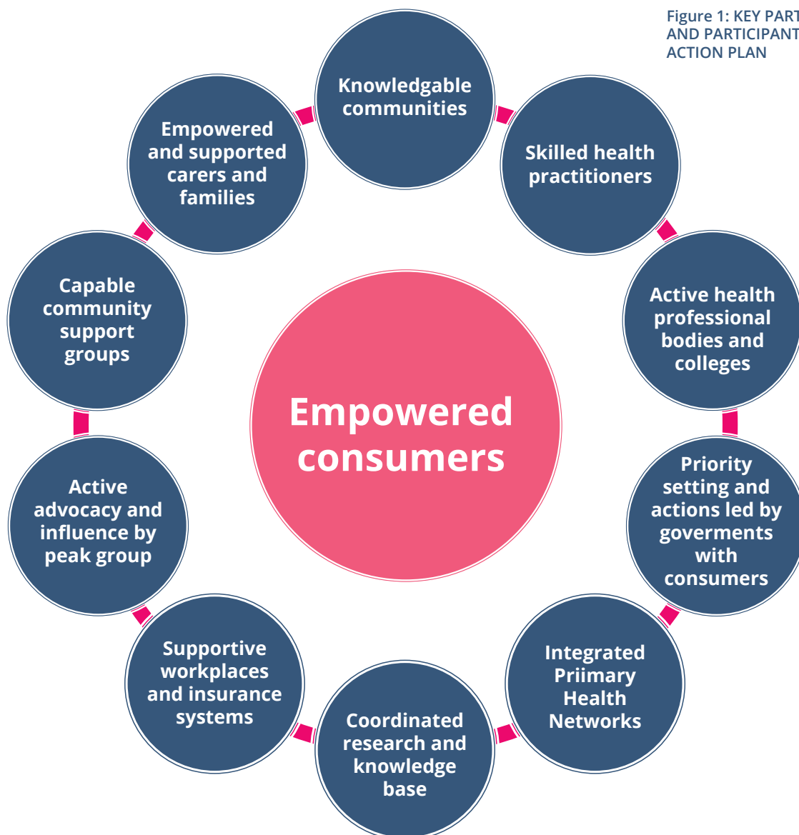
Figure 1: KEY PARTNERSHIPS AND PARTICIPANTS TO DELIVER ACTION PLAN

In 2010, Australia was the first country in the world to develop a national framework for pain, as 200 delegates gathered to develop a National Pain Strategy which provides a blueprint for the treatment and management of acute, chronic and cancer pain. Pain medicine is an independent medical speciality; the importance of interdisciplinary care is recognised; and our education and research programs are internationally recognised. We must harness the opportunity of our collective local knowledge and expertise, and implement effective initiatives that are evidence based, reflect current national guidelines, and align with key national health initiatives such as MyHealth Record.